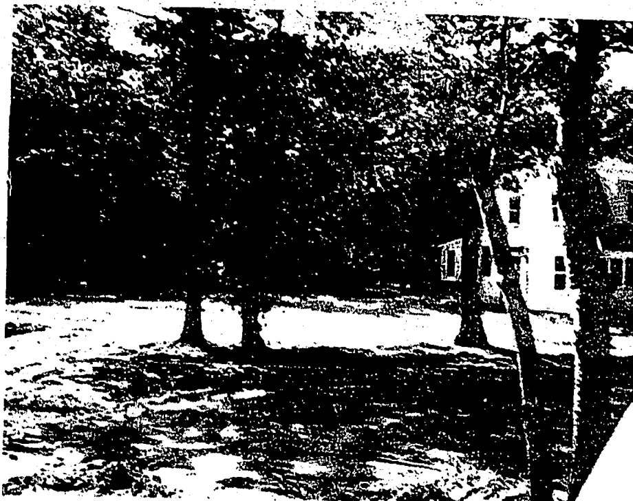
Area beside former Henry Merry dwelling was first to be cleared of debris.